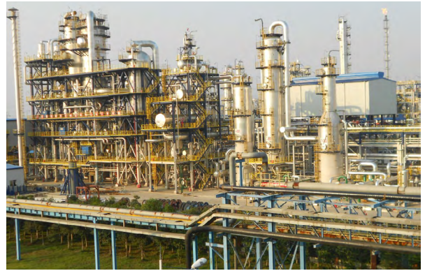
Operating MTO unit in Nanjing, China

UOP's suite of commercialized oligomerization technologies spans decades (including Cat Poly, InAlk™, and Catolene™). UOP eFining fine-tunes that experience for jet fuel production.