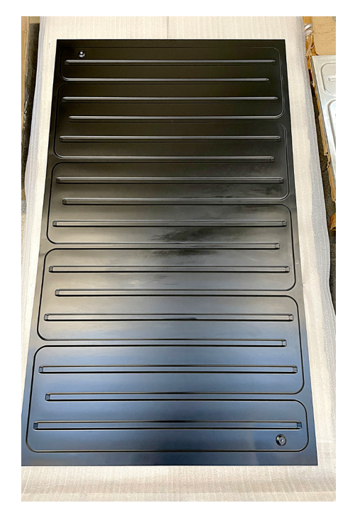
Channel plate produced with our jetflux braze material.