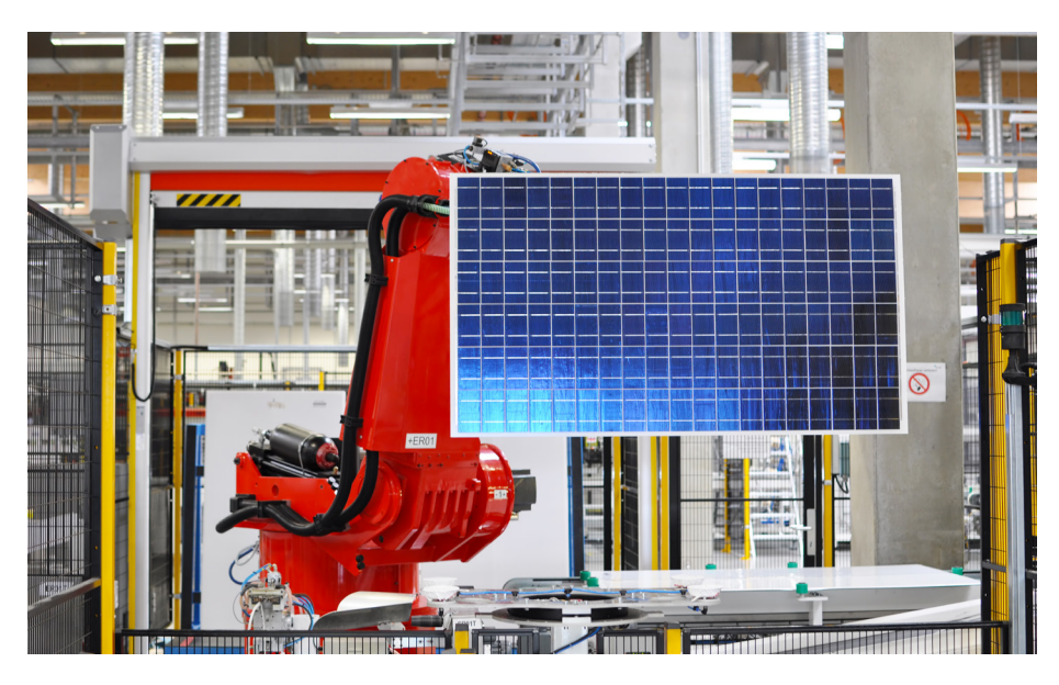
The picture shows the assembly process of solar panels

Beyond the success of this test case, there is a market opportunity for jetflux technology in a wide range of applications, from heaters and radiators for air conditioning where jetflux can enable complex formed designs to powertrain cooling components in electrical vehicles, where large base cooling plates or light channeling fins enable active thermal management of battery packs. Only when optimally cooled do EV batteries operate with