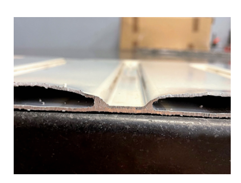
Channel plate after brazing

from forming in process equipment and from blocking jet nozzles. The particles have an extremely low melting onset, giving them more time to react to and disrupt the oxide and thus promote brazed joint formation.